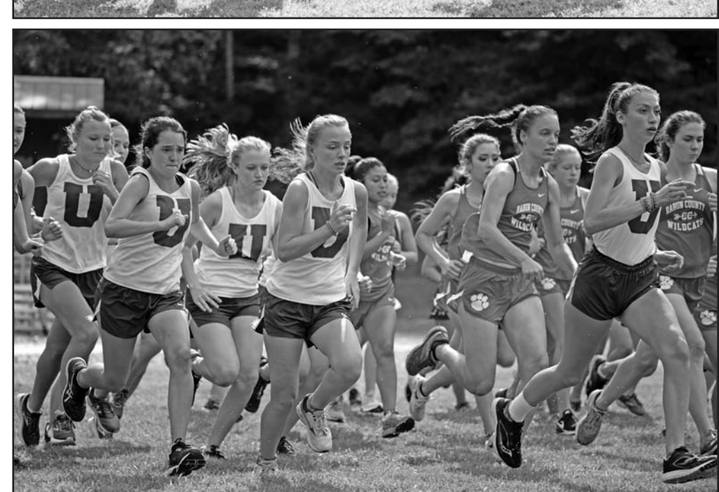
Cross Country photos by Todd Forrest